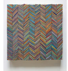
Jenny Wu, Bad Reporting , latex paint, resin on wood panel, 10 x 10 x 2.5 inches