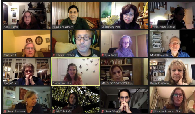
Advisory Board Meeting, Saturday, November 23, 2020

that brings expertise from other nonprofit arts organizations, galleries, collectors, artists, etc. For a current list of Washington Sculptors Group Board of Trustees and Advisory Board members plus their affiliations, please see page 2 of the newsletter.