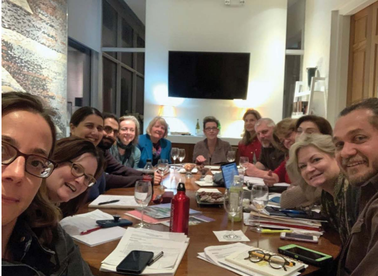
WSG Board of Directors prior to pandemic

It was uplifting to see our amazing WSG community, including our incredible returning and new members, as well as our esteemed Advisory Board members. Because of your compassion, resilience, and creativity, we continue to grow and embrace more artists and sculptors throughout the region. Please continue making and sharing about your work. Thank you!