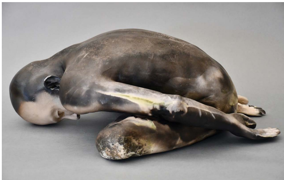
Chris Corson, Plinth , pit-fired ceramic, 8 x 18 x 23 inches

Events that are likely to be available after publication will be marked with a ■.