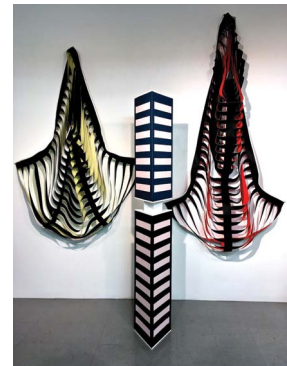
Judith Pratt, Point of Origin: Hides (installation), acrylic paint, acrylic ink on Lenox 100 paper, foamcore board, 8 x 15 x 3 feet (dimensions variable)