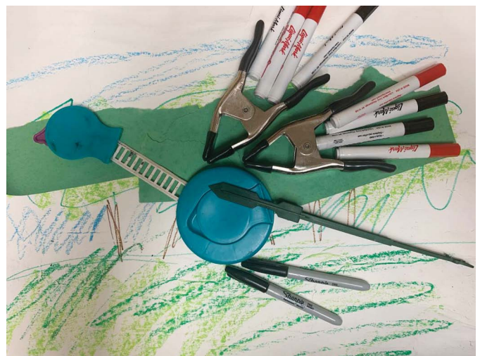
Bird With Background Assemblage: Teacher Demonstration, mixed media, 18 x 24 x 2 inches

Considering that few critically acclaimed, contemporary works are appreciated solely for their good looks, why is it that beauty should still be the central goal of so much instruction for younger people? The truth is that, where I like handsome objects, we have trouble defining, in certain terms, what beauty is and so, in a world in which we must admit that there may be no normative criteria for taste, the best any of us can do is become good at describing what we are doing.