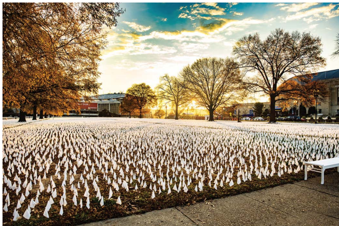
Suzanne Firstenberg, flags memorializing Covid deaths

of magnitude may be the only way to reach the nation’s conscious when numbers are this high and the realities are too brutal to acknowledge. In this case, the meaning of the flags, like the quilt and the poppies, was completed by the victims. It is no wonder that this