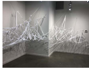
Liz Ashe, Helix @ 39 , cotton rope, upcycled cotton fabric