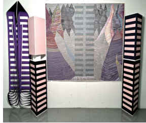
Judith Pratt, Point of Origin: Station #1 (installation), acrylic paint, acrylic ink on Lenox 100 paper, foamcore board, 8 x 15 x 5 feet (dimensions variable)

■ Judith Pratt , Point of Origin: Piedmont Stations , curated by Erica Harrison, Tephra Institute of Contemporary Art (formerly GRACE), Reston, VA, May 6–August 31. Reception/Artist talk: TBD.