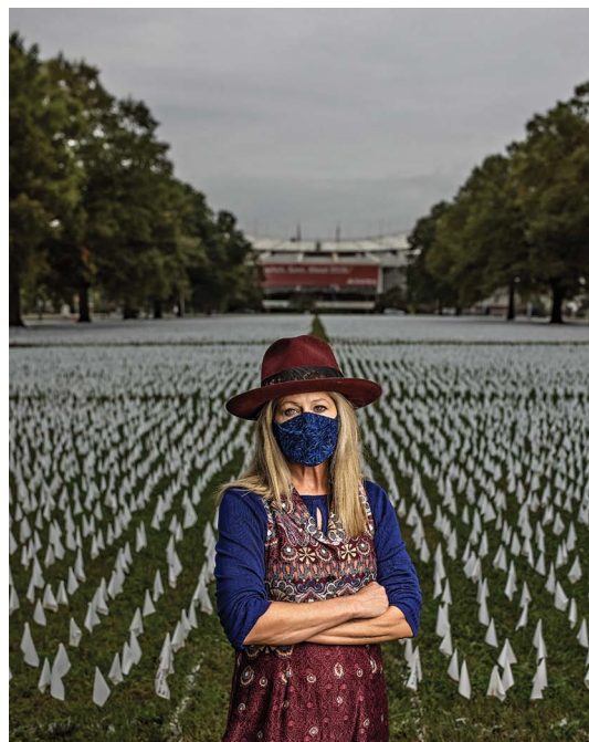
The artist in front of flags

“memorial by popular consent” was granted three extra weeks on display, until November 30. I can only imagine that this piece’s extension was guaranteed by being the right message (one of empathy), in the right place (the city where