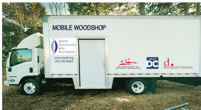
Mobile Woodshop for Zenith Community Arts Foundation