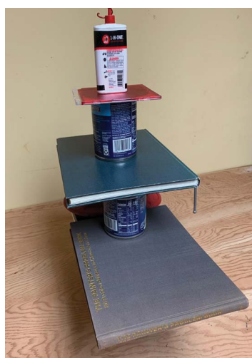
Tower Assemblage: Teacher Demonstration, mixed media, 24 x 14 x 10 inches

I believe that artists must make the most of ourselves by challenging the field with as many provocative works as we can muster. These refreshing confrontations cannot come from repeating conservative patterns of aesthetic object making, no matter how skillful or beautiful the results, so art lessons that singularly conform to commonly understood standards of beauty probably don’t challenge the status quo and, thereby, don’t reveal much about our current context. They simply reiterate and reestablish old ones. This is in direct conflict with what the art world seems to value at this point in time. In other words, making work that does not express fresh and interesting points of view probably won’t help children, or adults, critically think, which seems to be the point of art as it is practiced today.