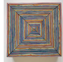
Jenny Wu, Keyboard Warriors , latex paint, resin on wood panel, 6 x 6 x 2.5 inches