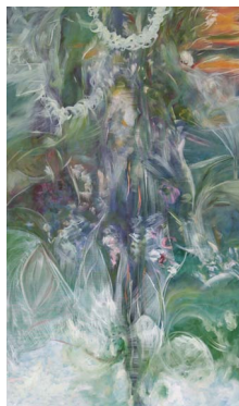
Mahy Dimitriou Polymeropoulos, Flowering Pair , oil on canvas, 30 x 60 inches

Mahy Dimitriou Polymeropoulos , Solo Exhibition , Big White Gallery, Mykonos, Greece, June - September, 2019. – Art Thessaloniki ; Gallery Art Forum, Thessaloniki, Greece, November 21–24, 2019. – NJV Athens Plaza, Explorer's Club , curated by rini Vantiraki Syntagma Square, Athens, Greece, April–November 2019.